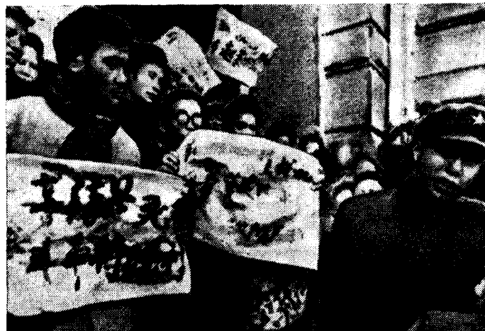
Popular discontent with the adventurist course of Mao's successors is growing.

Redundant labour begins to increasingly affect the socio-economic situation in the country, particularly as far as the young people are concerned. A growing number of jobless youth succumb to the temptation of "earning" their livelihood by breaking the law since they see no other way out. According to the Chinese press, the state security department in the city of Nanjing estimated that in the first half of 1981 three-quarters of all crimes were committed by unemployed youth.