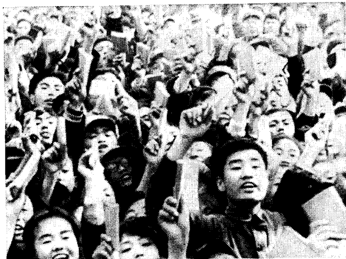
They still believe. Photo: Thousands of young Chinese cheering their leaders. Whither will they be led?

However, the ideological and political confusion and vacillation, caused by the manoeuvres around Maoism attest not only to the bankruptcy of the political course being pursued at home and abroad but also to the low effectiveness of the propaganda apparatus. It is not an overstatement that Mao's heirs have not succeeded in establishing their control over the domestic situation which is still very tense.