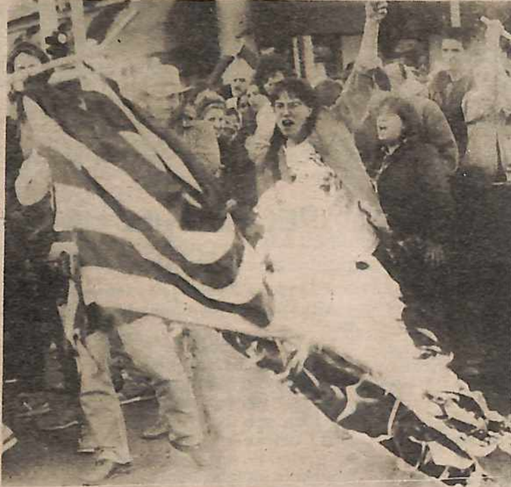
Pro-choice demonstrators after Supreme Court decision in July.

1989 was a year to usher in the new decade, and appropriately in this year, flag burning became the right thing to do for all those going up against Amerikkka. From coast to coast the bloody red, white and blue was torched, walked on, stomped on, and ripped up. This is some real progress! Bold actions delivered a defiant answer to the rulers' attempts to shove patriotism down our throats.