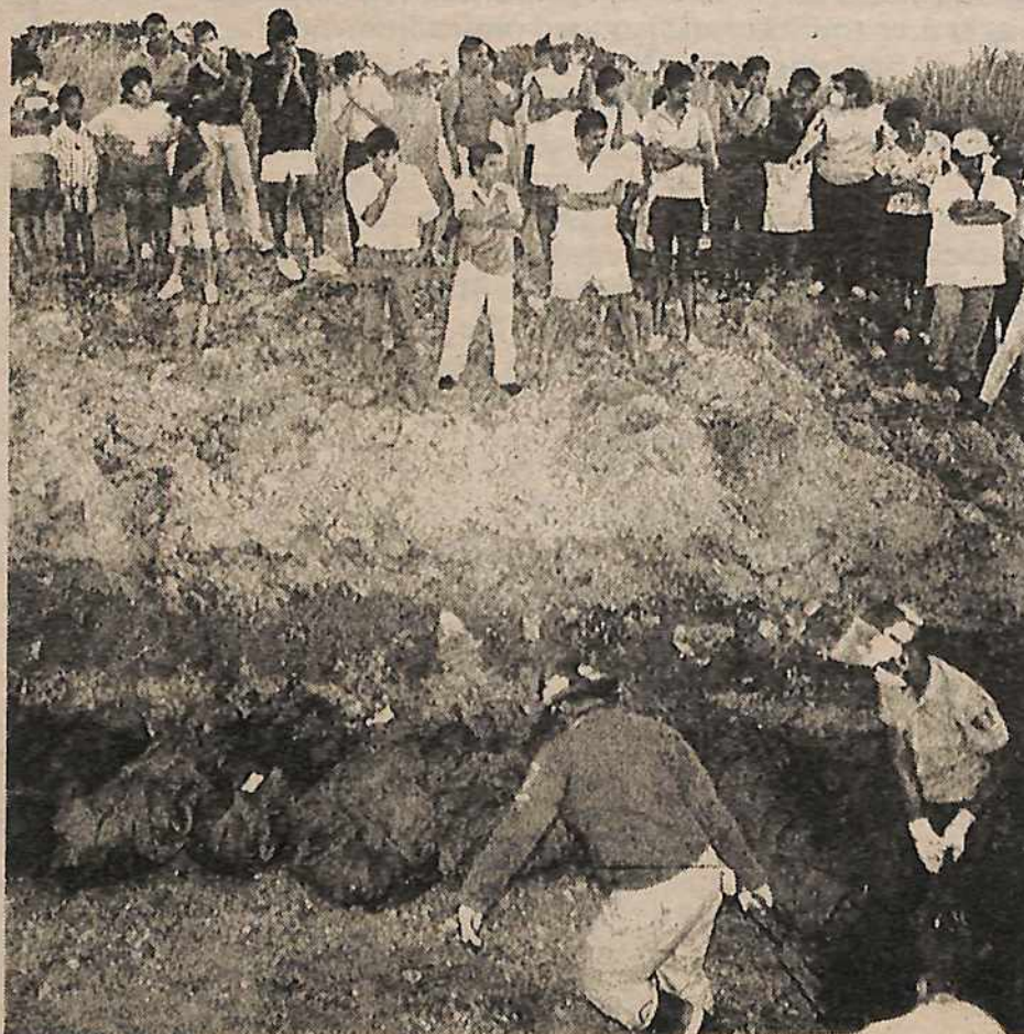
Panamanian civilians killed during the U.S. invasion are buried in mass graves.