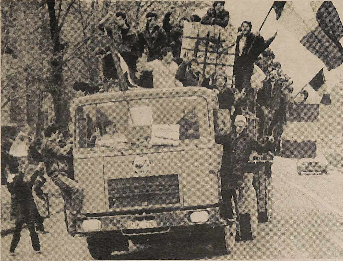
Romanians cheer the overthrow of Ceausescu.