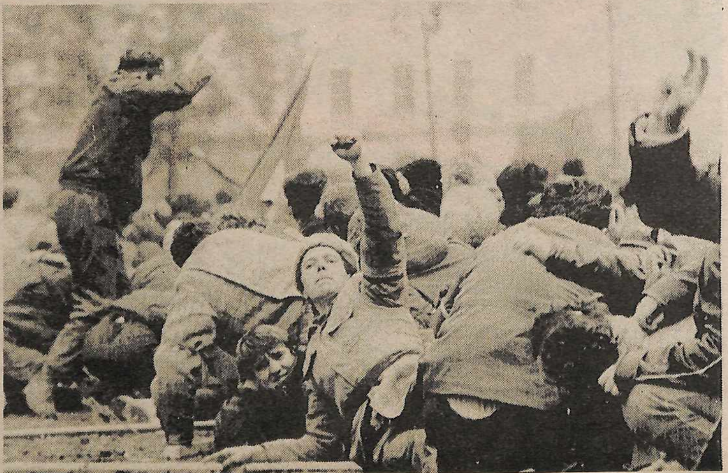
Residents of Bucharest face Securitate sniper fire.