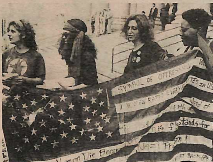
Pro-choice demonstrators, New York.

burned the flag. And the homeless in Tompkins Square Park also put the flag to flames in the midst of pig attacks on their encampment. When the rulers passed a law making it illegal to burn the flag, people in many different cities openly defied the law. In Seattle Vietnam vets led the way—at the stroke of midnight on the day the law went into effect, Vietnam Veterans Against the War AI led a "Festival of Defiance" of 500 people. A thousands flags were "napalmed on behalf of the 2-1/2 million Southeast Asian people murdered in Indochina by U.S. imperialism."