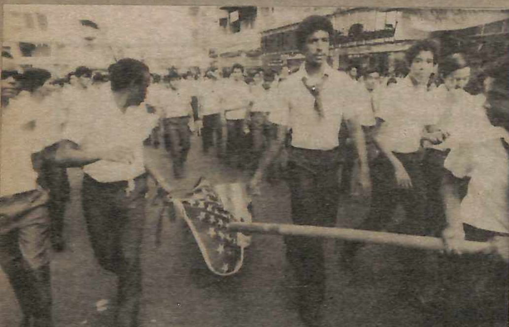
Panamanian students demonstrate against the U.S., 1978.

According to reports from participants in some of the demonstrations, there was a lot of support from people on the street for the protests against the invasion of Panama. The bourgeois media has been claiming that their polls show that 80 to 90 percent of the people in the U.S. solidly support the invasion. At the same time, the media is almost completely blacking out news of the protests against the U.S. intervention. □