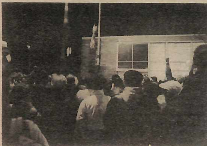
Seattle veterans torch flag, October 30.