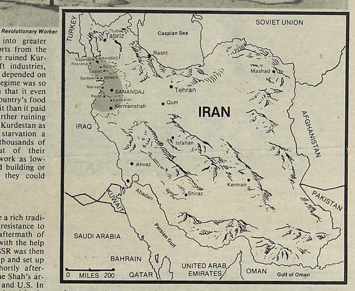
As a part of their revolutionary fight for autonomy within Iran, the Kurdish people are demanding control over all of Kurdestan (shown by the grey area on the map). The new Islamic government, like the Shah's regime before it, has kept the oppressed Kurdish nation split up into three provinces (marked by broken lines on the map).

With this great victory, the Kurdish people thought their day had finally arrived. Under the slogan "Democracy for Iran, Autonomy for Kurdestan," the Kurds demanded control over local government, police forces, education and cultural affairs within the framework of a democratic, unified Iran. New administrations in many cities and towns were set up in the face of the central government's attempts to