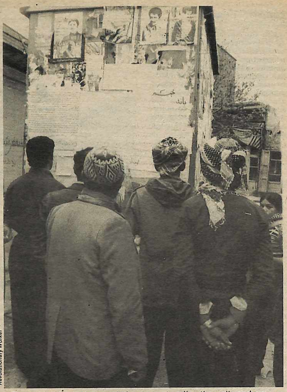
Throughout Kurdestan revolutionary posters line the walls and are attentively studied by thousands for the latest developments in the struggle.