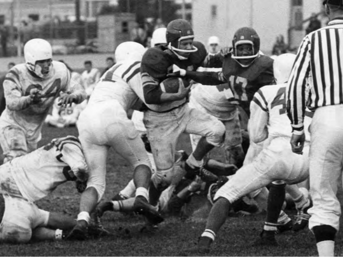
The author as high school quarterback: "a little guy, brimming with confidence."