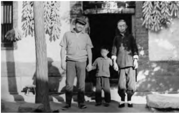
The old and the new generations, in revolutionary China.