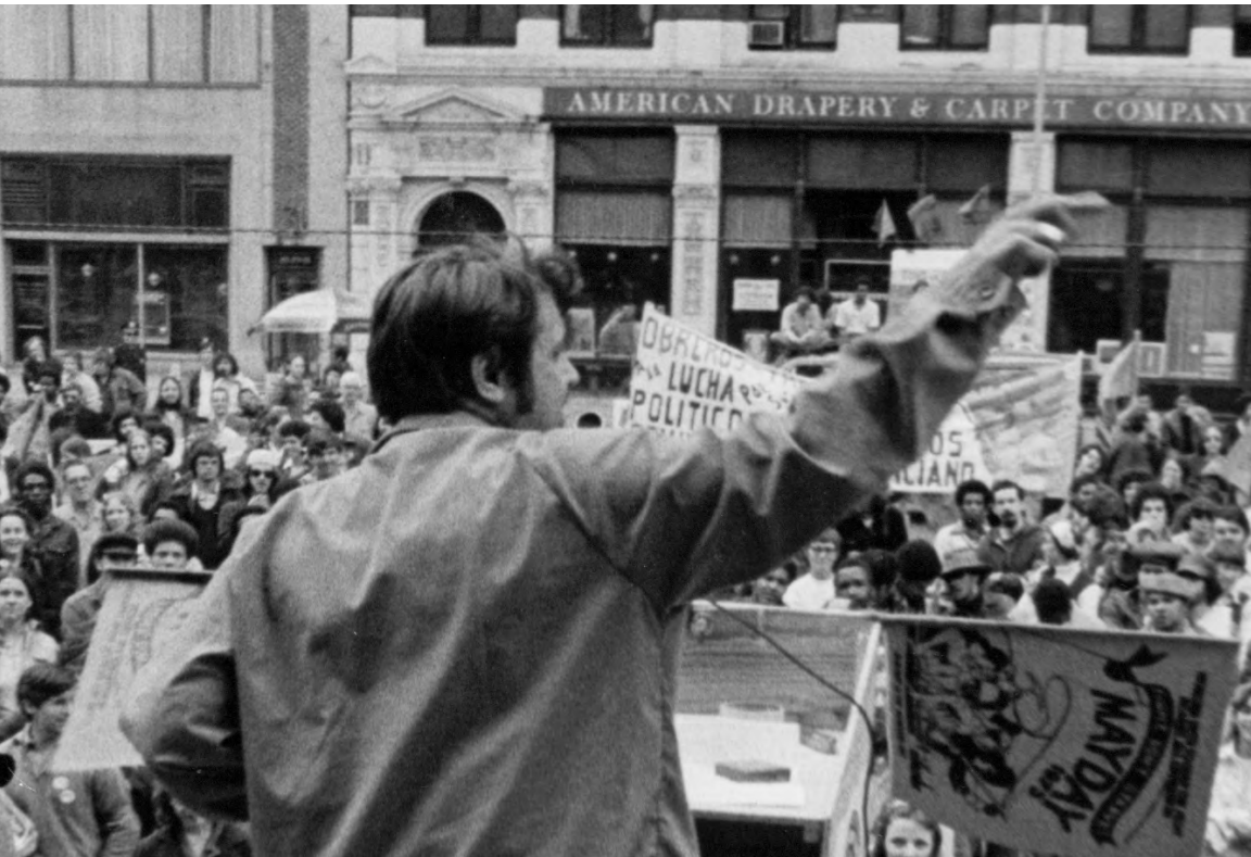
The author speaks at New York May Day celebration, 1975.

FBI surveillance files detail minute-by-minute movement of the author and associates, 1975 (left); FBI photo of author's house, mid-1970s (above). In June 1971, FBI director L. Patrick Gray noted to subordinates that "This is the kind of extremist I want to go after HARD and with innovation."