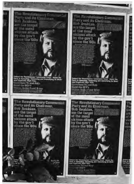
Posters building support for Bob Avakian's defense against felony charges as a result of the demonstration against Deng Xiaoping.