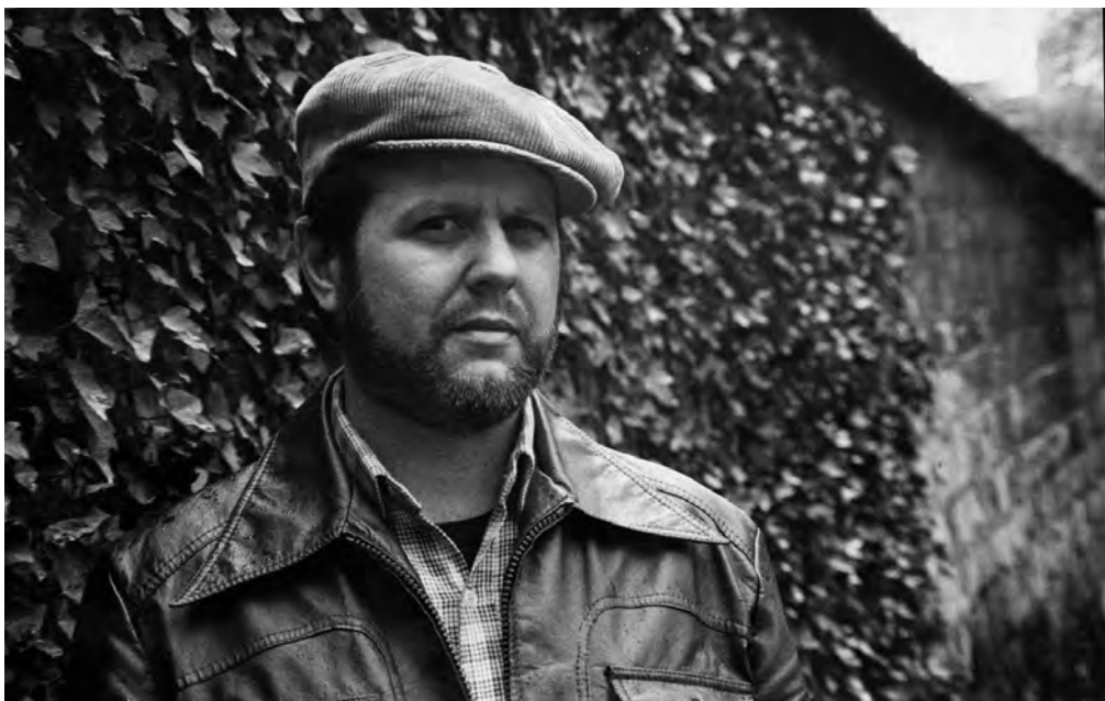
The author in exile, in front of the Wall of Communards in Paris, 1981.