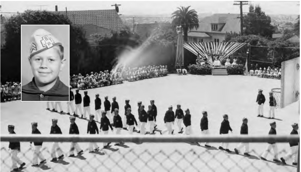
Traffic boys “being put through their paces”; the author in inset photo.