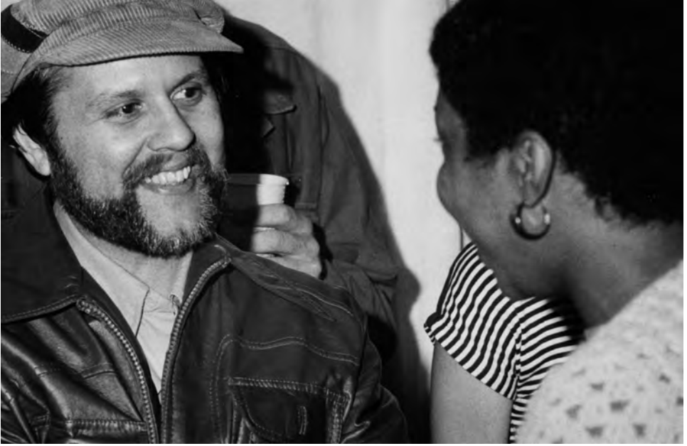
The author on a nationwide speaking tour as part of the effort to politically defeat the charges and develop a revolutionary movement, 1979.