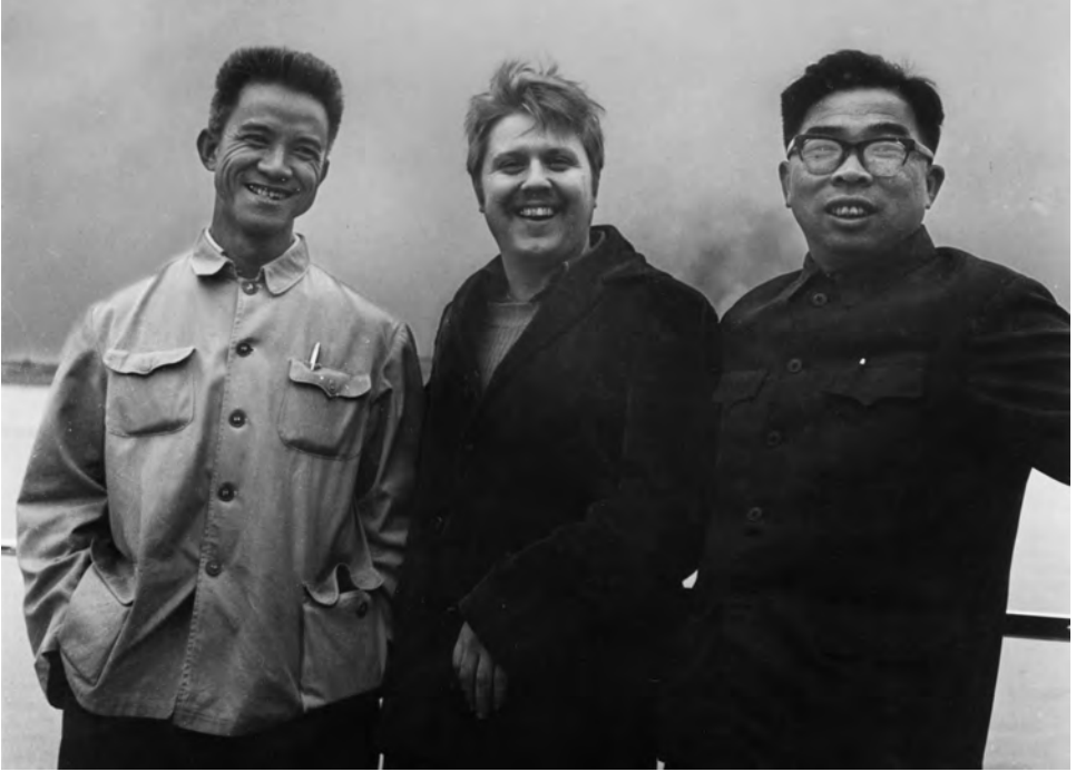
The author in revolutionary China, 1971, with two new comrades.