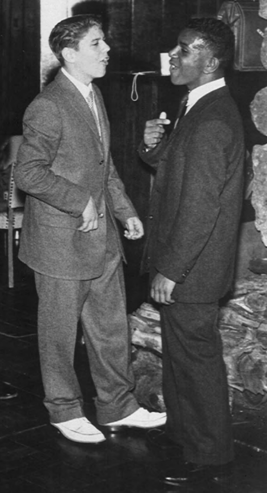
Singing doo-wop, with ninth grade best friend.