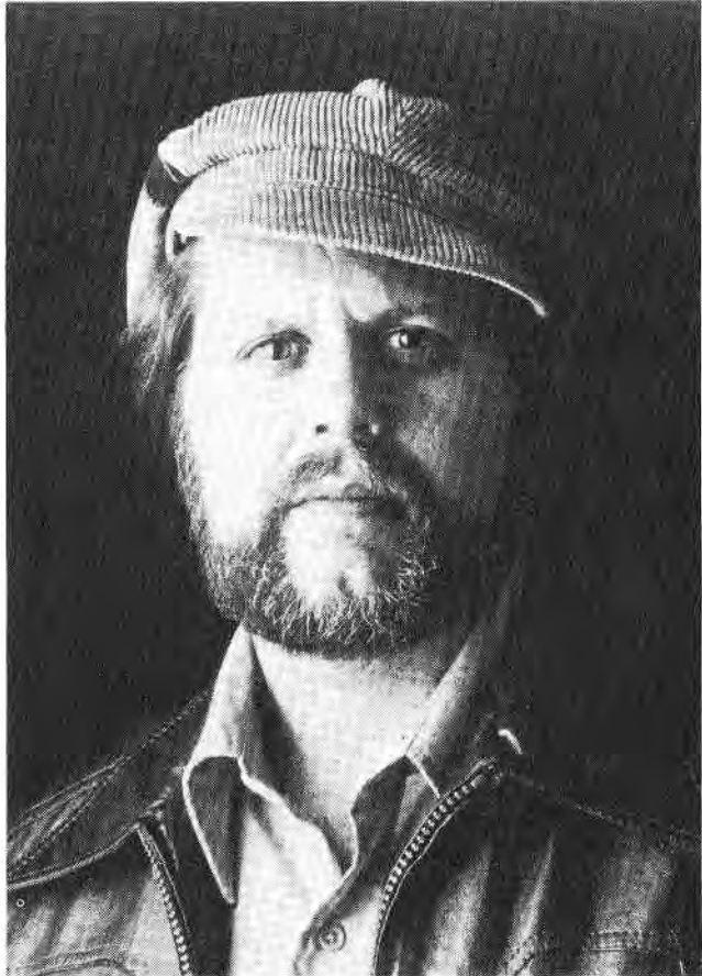
Bob Avakian, Chairman of the Revolutionary Communist Party, USA