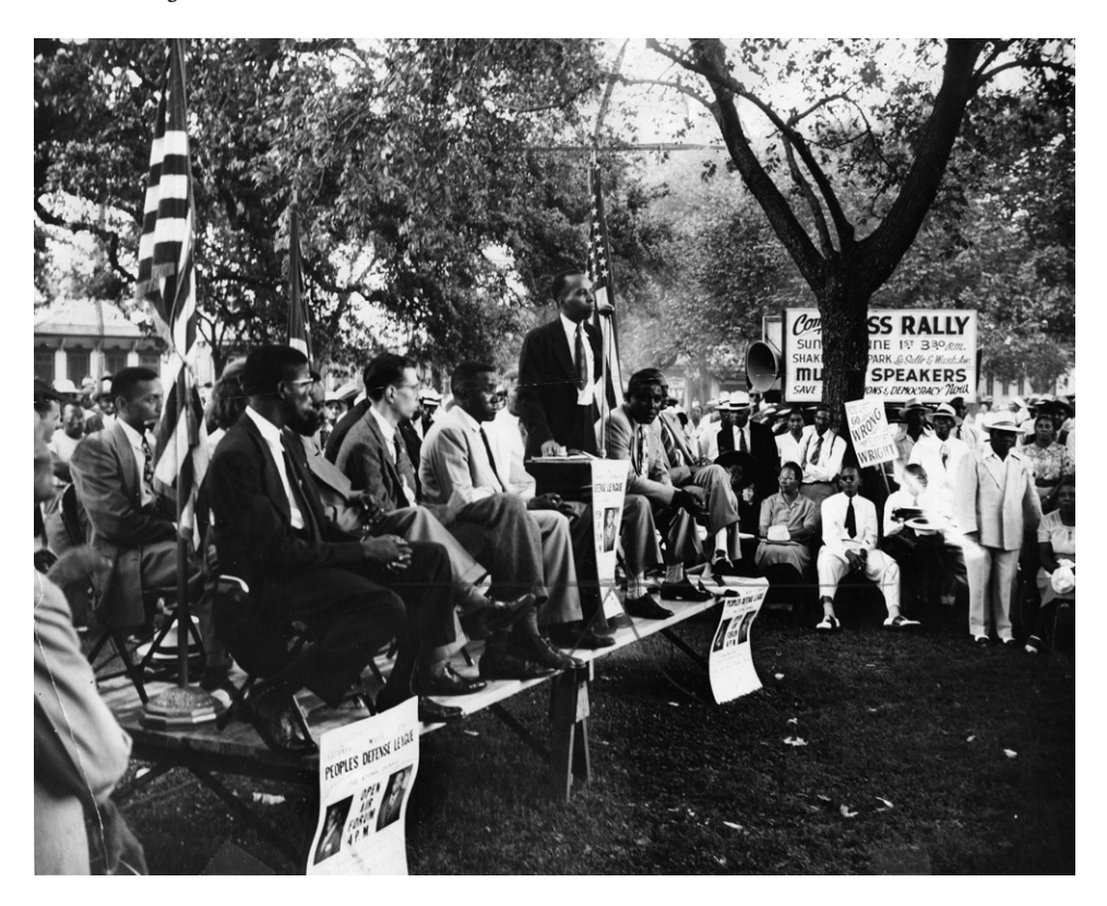
Fig. 1. Louis Burnham addressing longshoremen and teamsters at a right to vote rally, New Orleans, 1943.

directly in the race hostility against the negro, or avoid the issue, or apologize for the social obliteration of the color line in the class struggle." Debs' position was that race hatred was a direct attribute of economic inequality created by the capitalist system and would disappear through the process of the class struggle and the eventual triumph of socialism. He argued that since the issue of social inequality was a mere mask of the root problem of economic inequality, all social agitation on this issue was pointless, concluding there was "no negro question outside of the labor question—the working class struggle." While Debs repeatedly expressed his sympathy for the victims of racism and understood its historic roots, he firmly believed that any separate agitation on racism was simply a diversion from the class struggle.