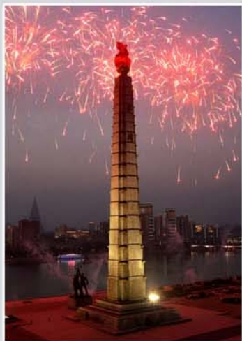
Back Cover: Firework display on July 6, 2017