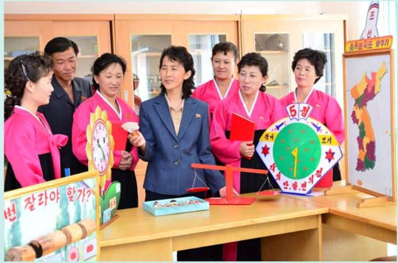
Teachers work hard to improve the quality of visual education.