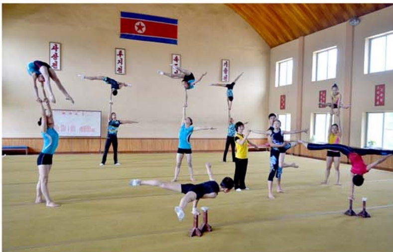
Sportspersons intensify physical training and polish technical movements.