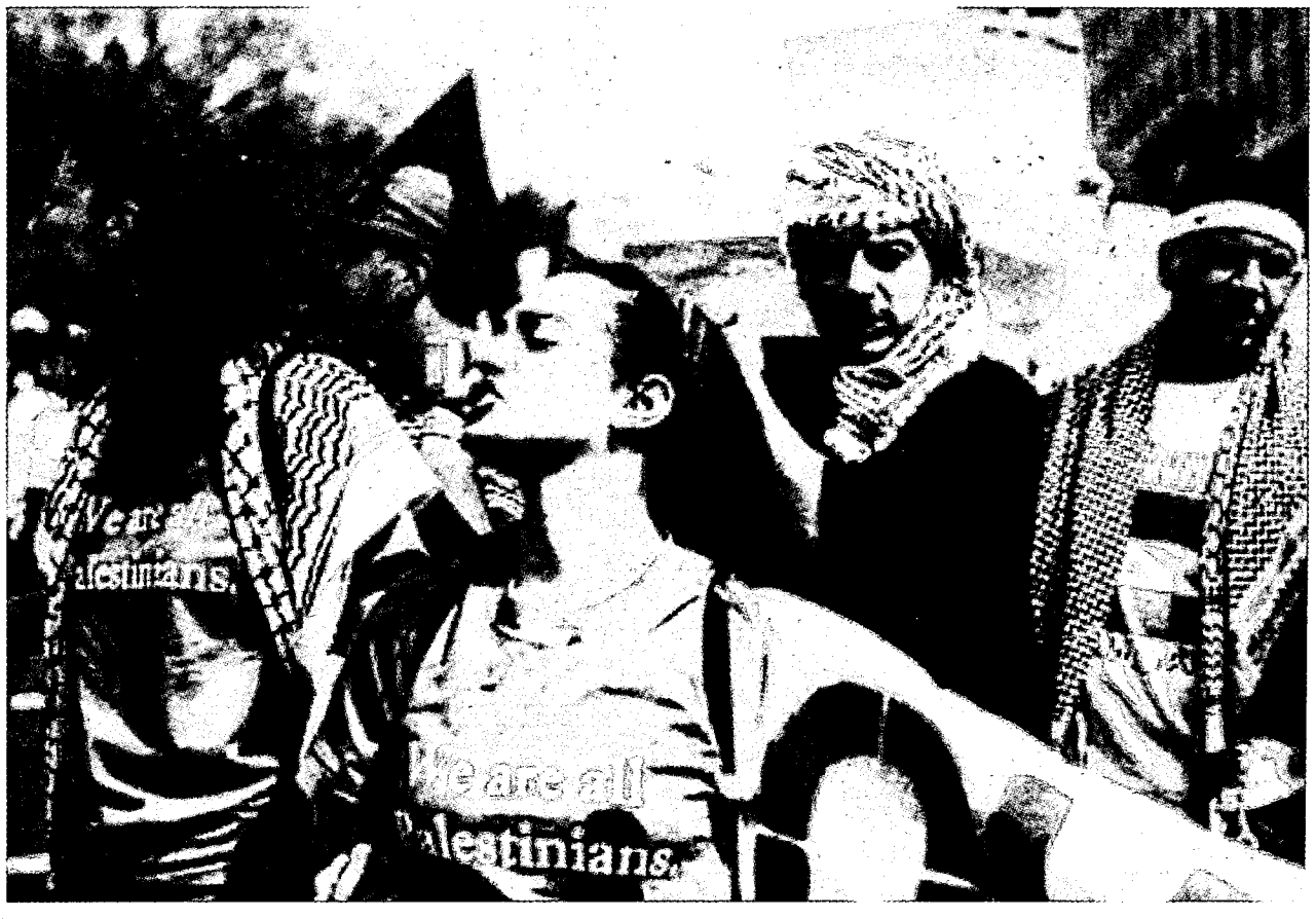
Washington, D.C. 20 April 2002.

comes to the fore through — this whole cauldron of contradictions.