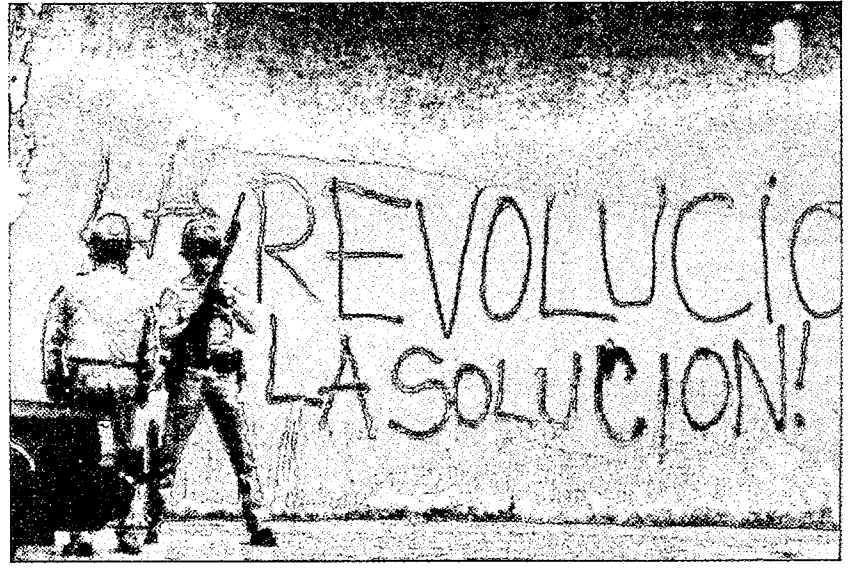
Los Angeles rebellion, April 1992.

I want to speak first of all to the strategic dimension involved in the current and developing situation since September 11, 2001. I think we have to look at it in terms of a very wide range of possibilities connected with what the imperialists are up to