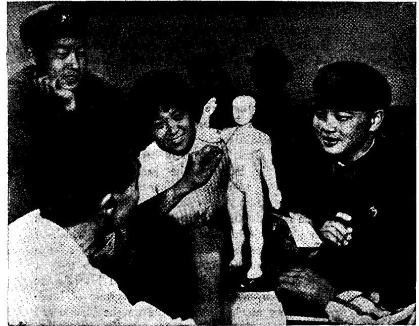
Learning modestly from the masses, persisting in useful work for the people.