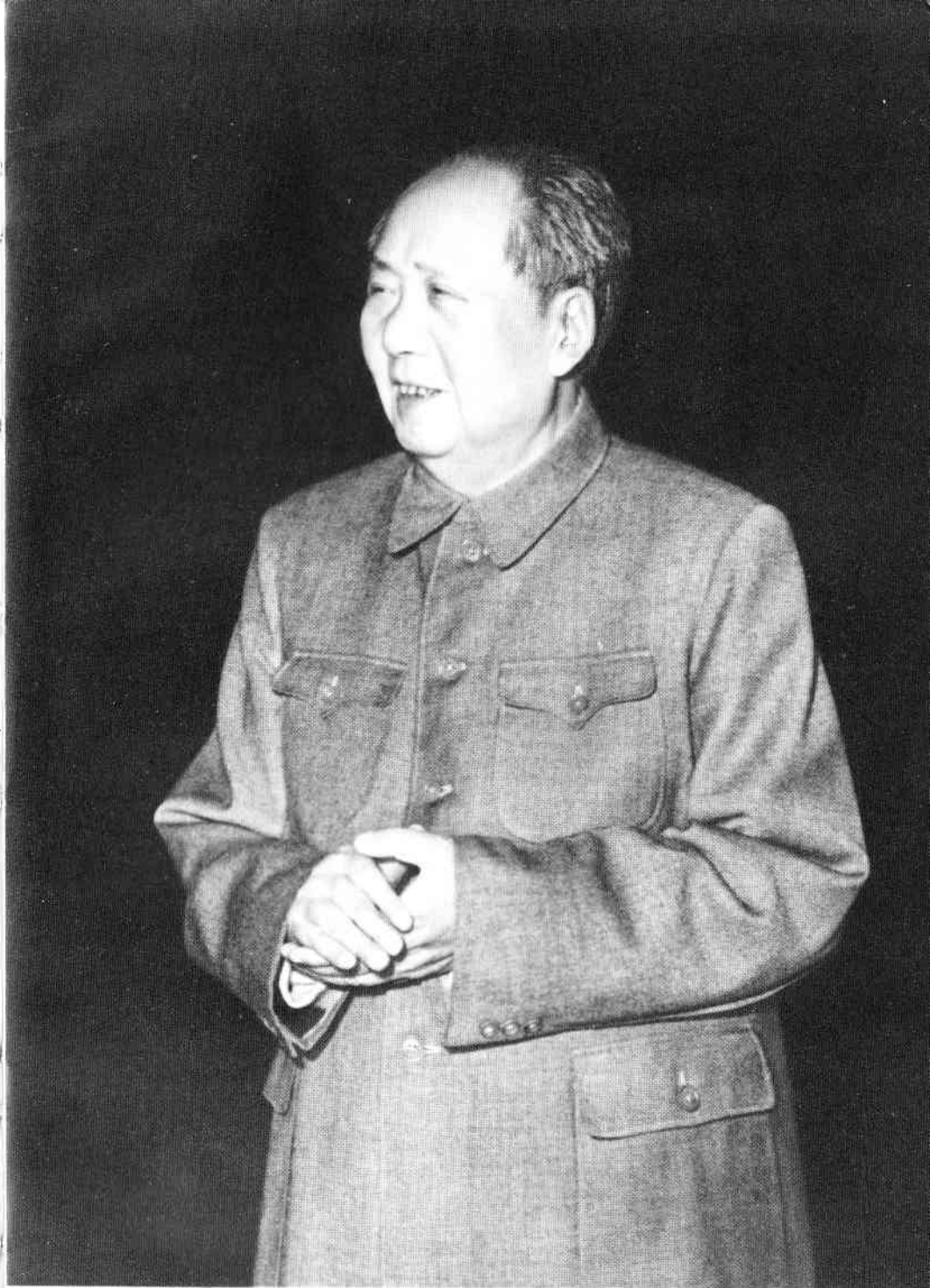
Our great leader Chairman Mao Tse-tung