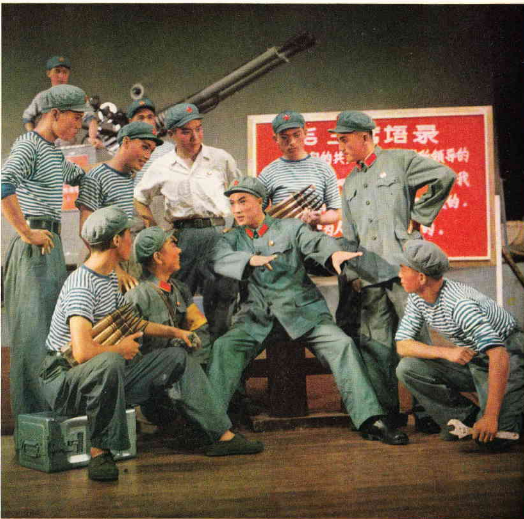
Following Chairman Mao's teachings on people's war, Squadron Commander Kuan and his fighters plan how to annihilate the enemy

Tieh: Remember — until we can see him, take dead aim and close in, we don't fire.