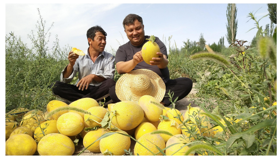
Villagers taste sweet melons harvested from a field in Kara Yar Village, Kashgar Prefecture, northwest China's Xinjiang Uygur Autonomous Region

hat do naan bread, paintings drawn with soldering irons, exquisite handmade tamburas, elaborately embroidered garments, edible fungi, raisins, melons and home-baked cakes have in common? They were on display at the sixth China-Eurasia Expo held in Urumqi, capital of northwest China's Xinjiang Uygur Autonomous Region, on August 30 and September 1. They also shared a common origin: They were all products of poverty alleviation programs in