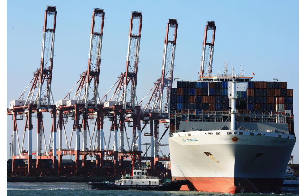
A fully loaded cargo ship leaves a container terminal at Qingdao Port, east China's Shandong Province, on October 19

According to NBS data, China's foreign trade volume improved by 9.9 percent year on year to 22.28 trillion yuan ($3.21 trillion). With exports of around 11.86 trillion yuan ($1.7 trillion), up 6.5 percent year on year, and imports of around 10.43 trillion yuan ($1.5 trillion), up 14.1 percent year on year, China's trade surplus