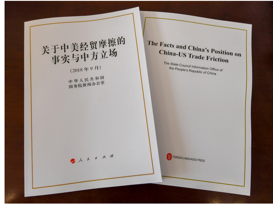
A white paper on China's position on China-U.S. trade friction is released by the Information Office of the State Council of China on September 25

Walker said the biggest takeaway from his 80 trips to China in 15 years is the total disconnect between what he sees in China—a happy people proud of Chinese accomplishments and a prosperous country—and what he reads in the Western press about China: unhappy people and an unsustainable government and economy. "If you look at what China has accomplished... huge improvements in literacy, longevity and the raising of people out of poverty... the