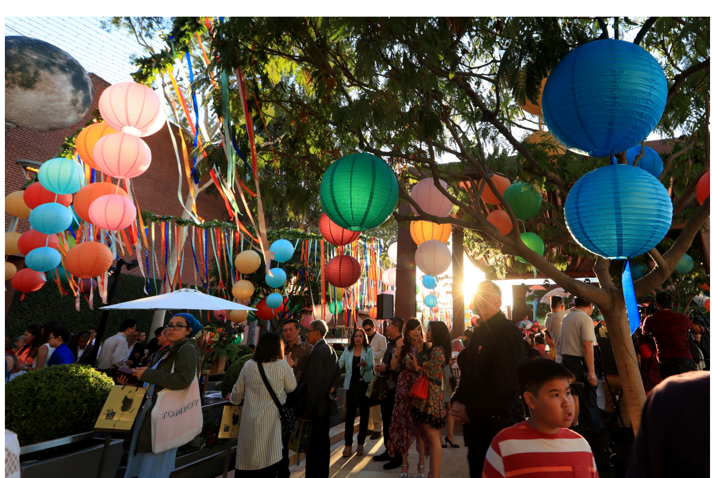
People attend an activity celebrating the Chinese Mid-Autumn Festival in South Coast Plaza in Costa Mesa, the United States, on September 23

"It would be unrealistic to expect a fundamental resolution in the near term but that does not mean that we cannot see some progress," Janow told the media on the sidelines of the forum. "My hope is we get progress where we can and keep working on those [problematic] areas that remain.'