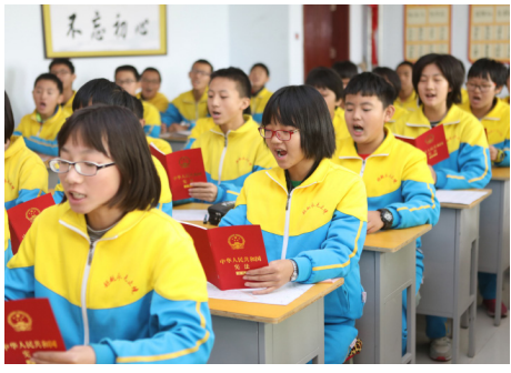
Students at the Zhi Zhen Experimental Middle School in the city of Hengshui, Hebei Province, read the Constitution on December 4, 2017 on China's fourth Constitution Day

As the ruling party, the CPC has continually advanced with the times, constantly attempting to perfect the national governance system to adapt to new circumstances. The CPC Central Committee decided to initiate a constitutional revision at a Political Bureau meeting on September 29, 2017. It made public its proposal on changes to the Constitution on February 25.