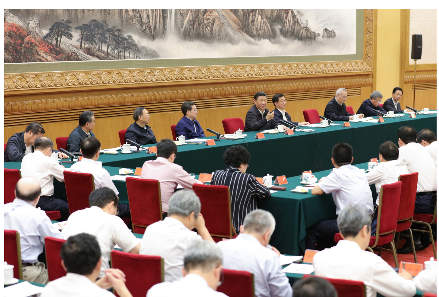
Chinese President Xi Jinping (C, rear), also general secretary of the Communist Party of China (CPC) Central Committee and chairman of the Central Military Commission, addresses a symposium marking the fifth anniversary of the Belt and Road Initiative (BRI) in the Great Hall of the People in Beijing, capital of China, Aug. 27, 2018