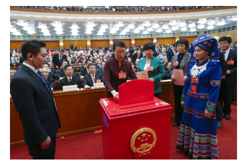
Lawmakers cast their ballots on an amendment to China's Constitution at the Third Plenary Meeting of the First Session of the 13th National People's Congress in Beijing on March 11

n March 11, the 13th National People's Congress (NPC), China's national legislature, adopted an amendment to the Constitution, marking the first such revision in 14 years.