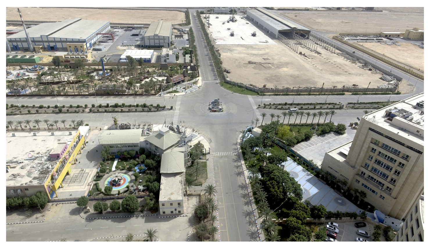
An aerial view of the China-Egypt economic cooperation zone undertaken via the cooperation framework of the Belt and Road Initiative in Ain Sokhna, Egypt, on June 17

he Belt and Road Initiative has been with us for five years now. It first manifested itself as the new Silk Road in 2013 when Chinese President