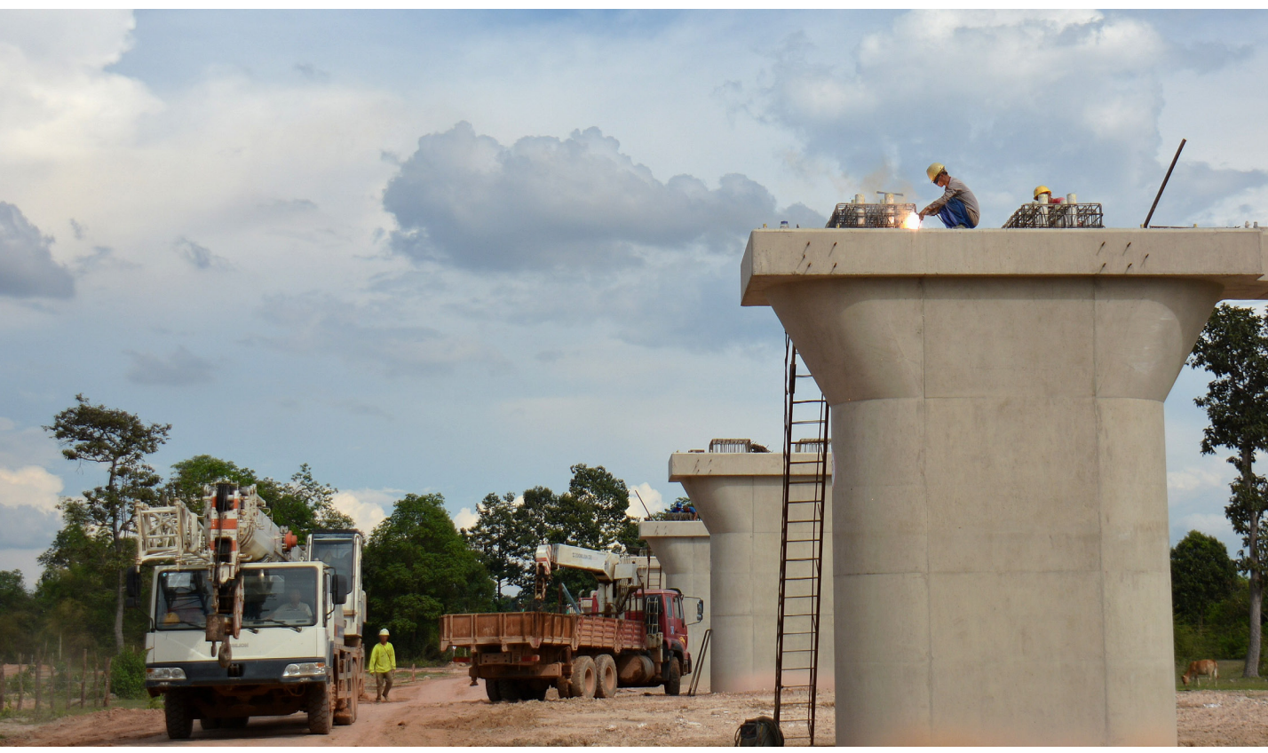
The construction site of a bridge along the China-Laos railway on May 2 in Vientiane, capital of Laos