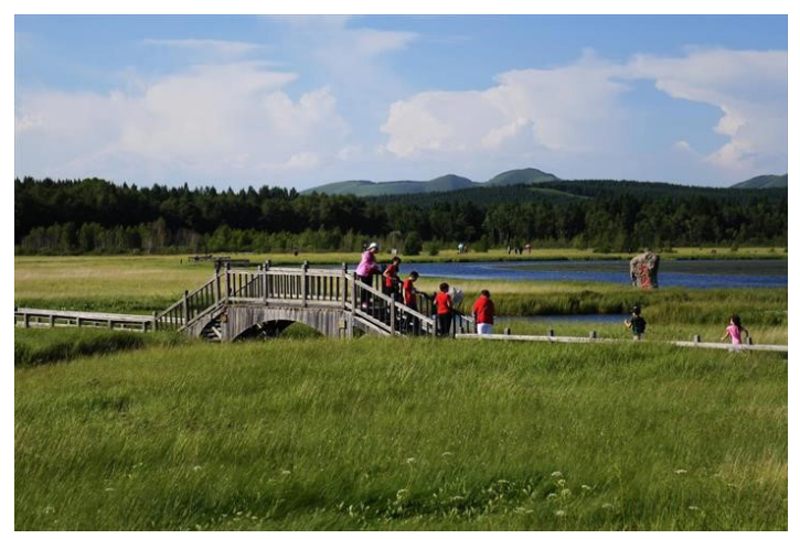
Tourists at the Qixing Lake in Saihanba Forest Park on July 11

On the third day, they spotted the giant larch standing upright against the bitingly cold wind. They were so excited by the sight that they hugged it in relief for it indicated that at least one tree species could survive the harsh weather condition there.