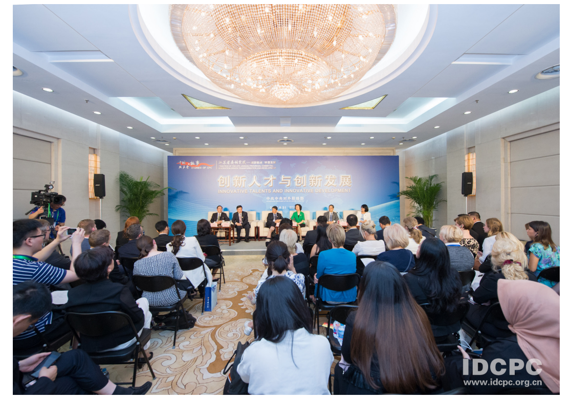
The forum with a theme of "Innovation Talents and Innovative Development" is held as a sideline event during the thematic briefing in Beijing on August 31

Jiangsu is also home to 167 universities, over 1.9 million college students, 757 independent research institutes and 760,000 research and development (R&D)