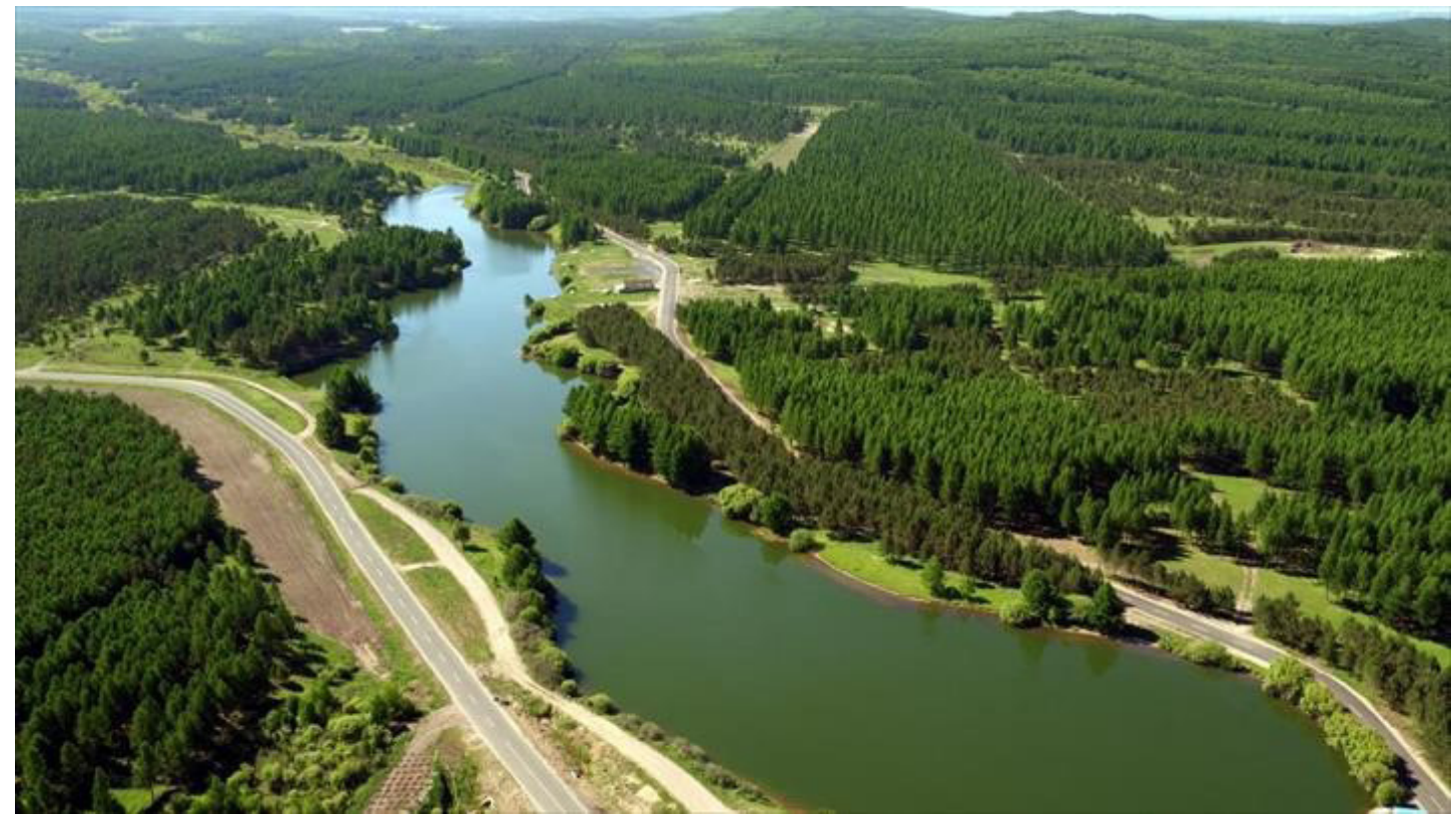
A bird's-eye view of Saihanba on August 15

giant tree rules the large fields dotted with wildflowers in the Saihanba Jixie Forest Farm. Planted in the Qing Dynasty (1644-1911) period, the nearly 20-meter larch is said to have survived 200 years of vicissitudes. Belying its age, it still looks vigorous and indefatigable with branches stretching out and its strong trunk wrapped with red ribbons.