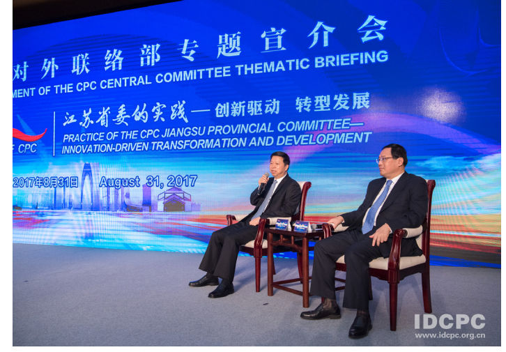
Song Tao, Minister of IDCPC, and Li Qiang, Secretary of CPC Jiangsu Provincial Committee, attend the thematic briefing and answer questions from foreign political party leaders and ambassadors

ranking first in China. Jiangsu has over 13,000 hi-tech companies. In 2016, the hi-tech industry's output value accounted for 40