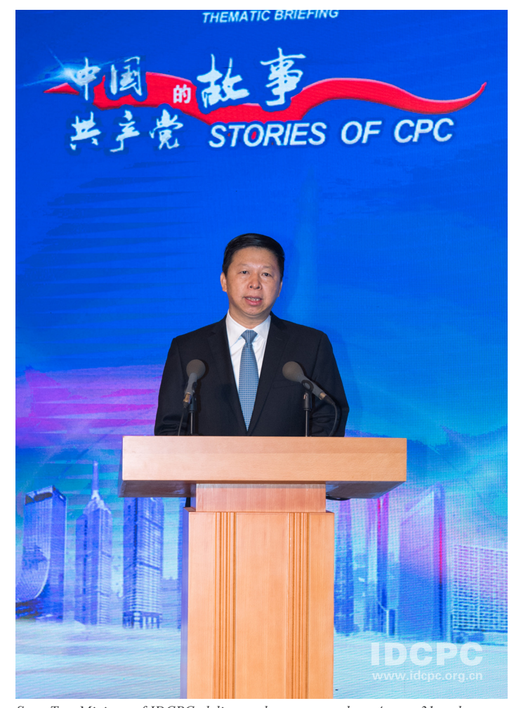
Song Tao, Minister of IDCPC, delivers a keynote speech on August 31 at the thematic briefing which around 400 visiting foreign political leaders, ambassadors and scholars attend

Source of the CPC and Li Qiang, Secretary of the CPC Jiangsu Provincial Committee,