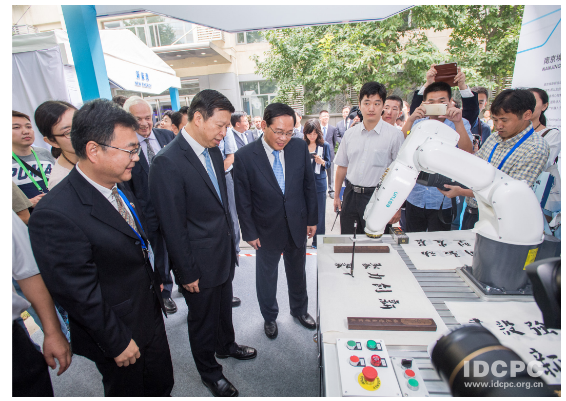
Song Tao (second left), Minister of IDCPC, and Li Qiang (third left), Secretary of CPC Jiangsu Provincial Committee, watch a Chinese calligraphy show by a robot designed and assembled in Jiangsu on August 31 in Beijing

The event, the fourth part of the Stories of the CPC series launched by the IDCPC, aimed to introduce China's efforts to become a country of innovation through dedication to education, talent development, technological breakthroughs and structural reforms with the example of Jiangsu Province.