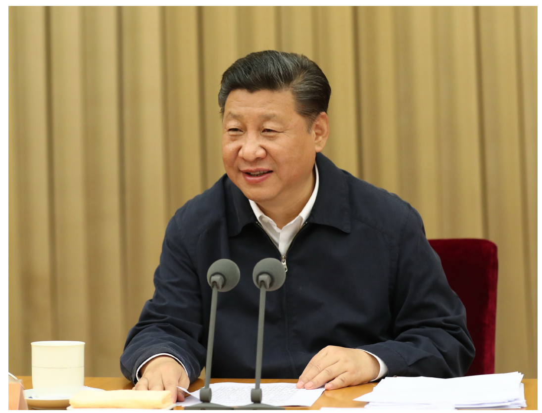
President Xi Jinping addresses the opening session of a workshop for provincial and ministerial officials in Beijing on July 27