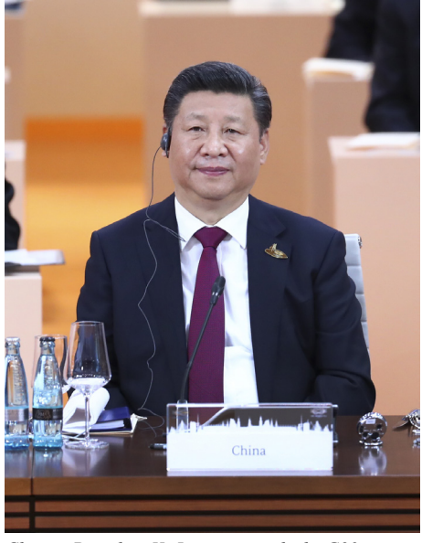
Chinese President Xi Jinping attends the G20 summit in Hamburg, Germany, on July 7

His attendance contributed to maintaining and advancing the group's cooperation, Chinese Foreign Minister Wang Yi said on July 8.