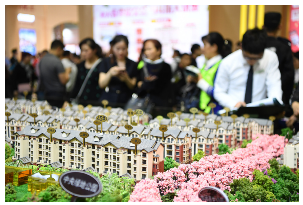
The 2017 Spring Housing Fair in Chongqing Municipality on April 20

In the first five months of the year, major industrial enterprises' profits surged 22.7 percent year on year. In June, the purchasing managers' index (PMI) for the manufacturing sector stood at 51.7, 0.5 points higher than in May, while non-manufacturing PMI stood at