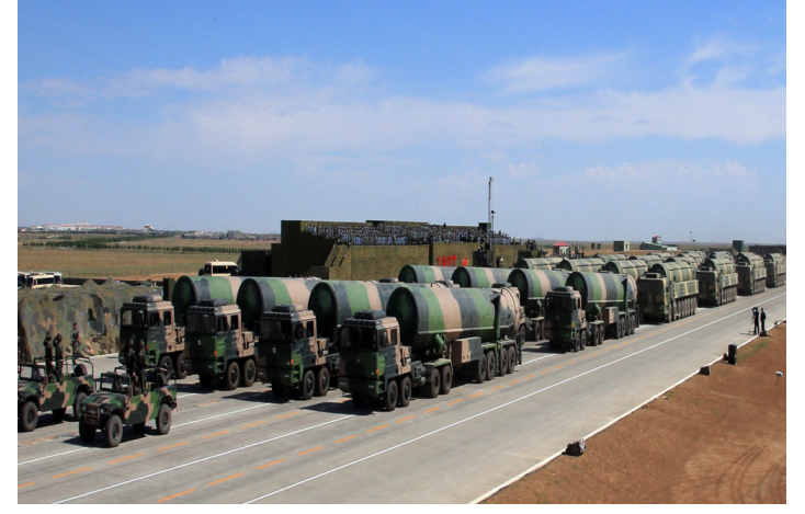
Nuclear missiles are reviewed (XINHUA)

love for the country and determination to serve the country," he said. "It's the dedication and sense of responsibility of individual soldiers that build a strong army. We will continue to do our best to complete each assigned task, be it big or small."