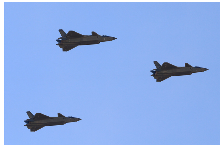
An echelon of J-20 stealth fighters flys over the parade ground (XINHUA)