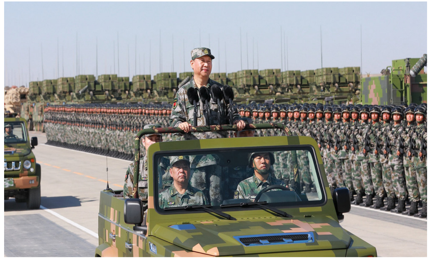
President Xi Jinping, also General Secretary of the Communist Party of China Central Committee and Chairman of the Central Military Commission, reviews troops