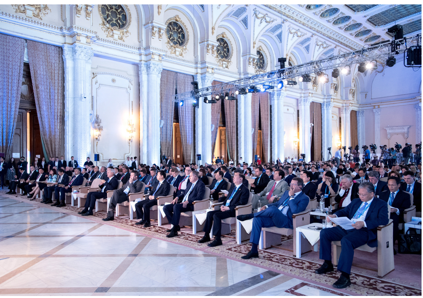
A panorama of Political parties leaders attending the 2017 China-CEE Countries Political Parties Dialogue in Bucharest on July 14