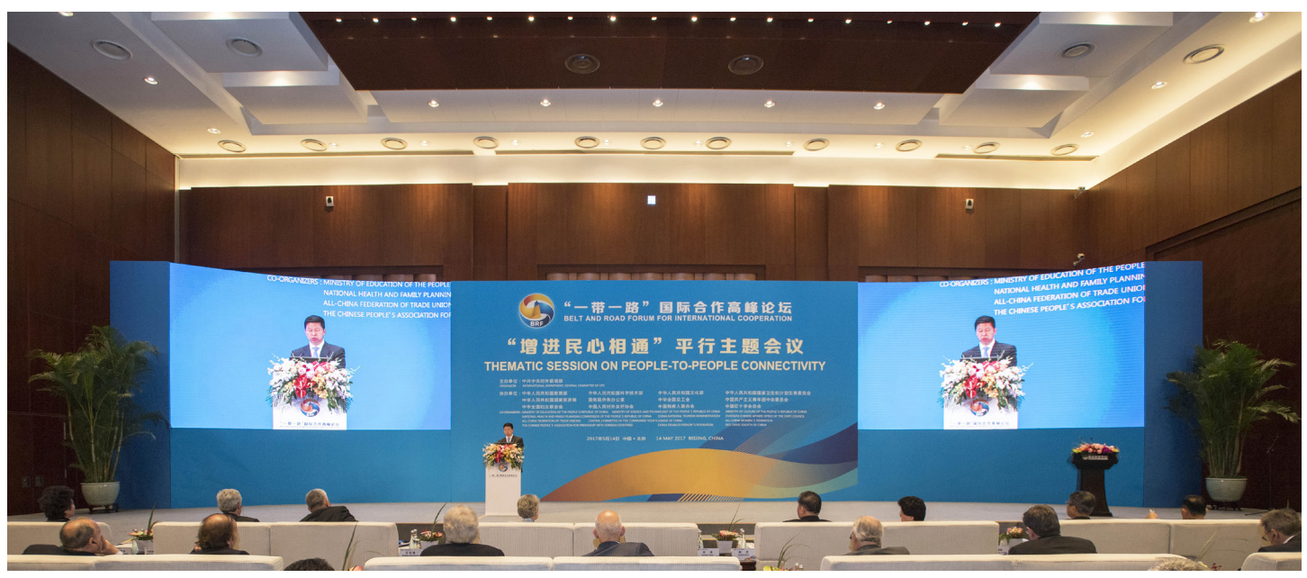
Song Tao, Minister of the International Department of the CPC Central Committee, delivers a keynote speech at a thematic session on people-to-people connectivity of the Belt and Road Forum for International Cooperation