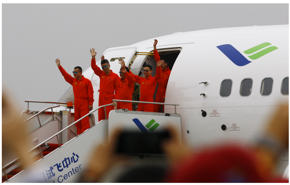
Crew members wave to the welcoming crowd after the C919, China's first indigenous passenger plane, completed its maiden flight and landed at the Shanghai Pudong International Airport on May 5

The data also show that most passengers travel on domestic flights. However, the