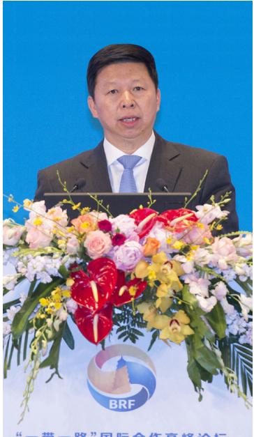
"一带一路"国际合作高峰论坛 BELT AND ROAD FOR UM FOR INTERNATIONAL COOPERATION

Song Tao, Minister of the International Department of the CPC Central Committee