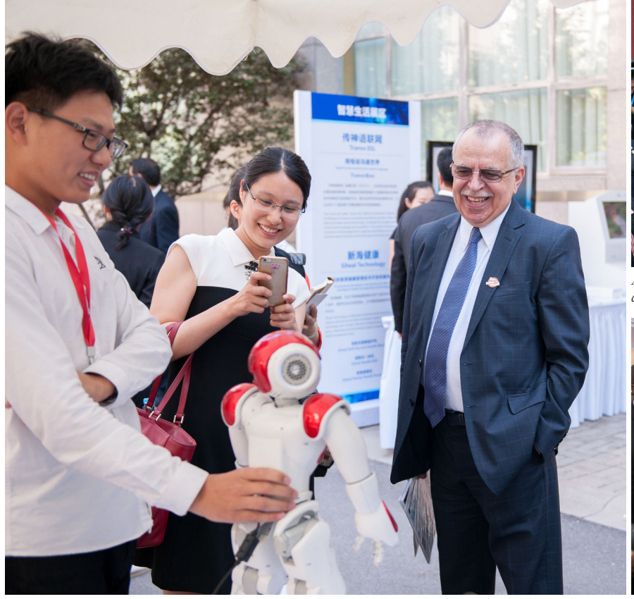
A participantor interacts with a robot in Hi-tech product show

The "Stories of the CPC's Targeted Poverty Alleviation" event, the first in the series, was held in Beijing on April 27. The International Department of the CPC Central Committee will work with the CPC Shanxi and Jiangsu provincial committees to hold promotional events in the coming months.