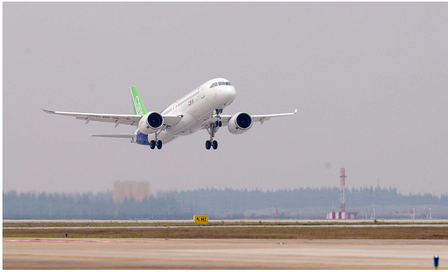
The C919 takes off from the Shanghai Pudong International Airport for a 79-minute maiden flight on May 5

hina's first indigenously made jumbo jet had completed its maiden flight on the afternoon of May 5, adding a milestone to country's aviation history.