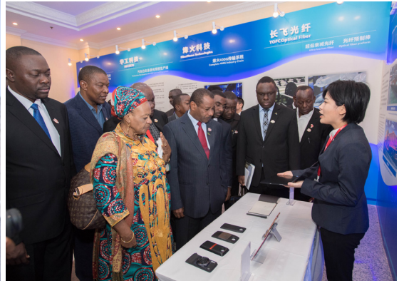
Participtors watch the presentation of a laptop computer product made in Hubei province