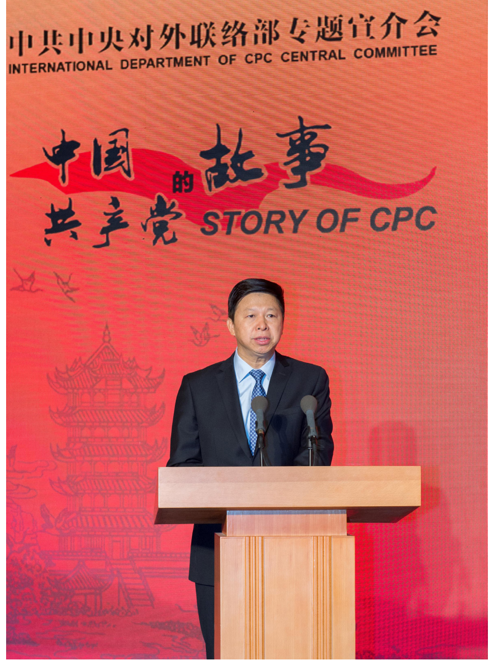
Song Tao, Minister of the International Department of the CPC Central Committee, delivers a keynote speech at the session on May 25

"The accomplishments are obvious. We have upgraded the economic structure, cultivated new drivers for growth, pushed forward green development, and improved the living standards of urban and rural residents," Jiang said.