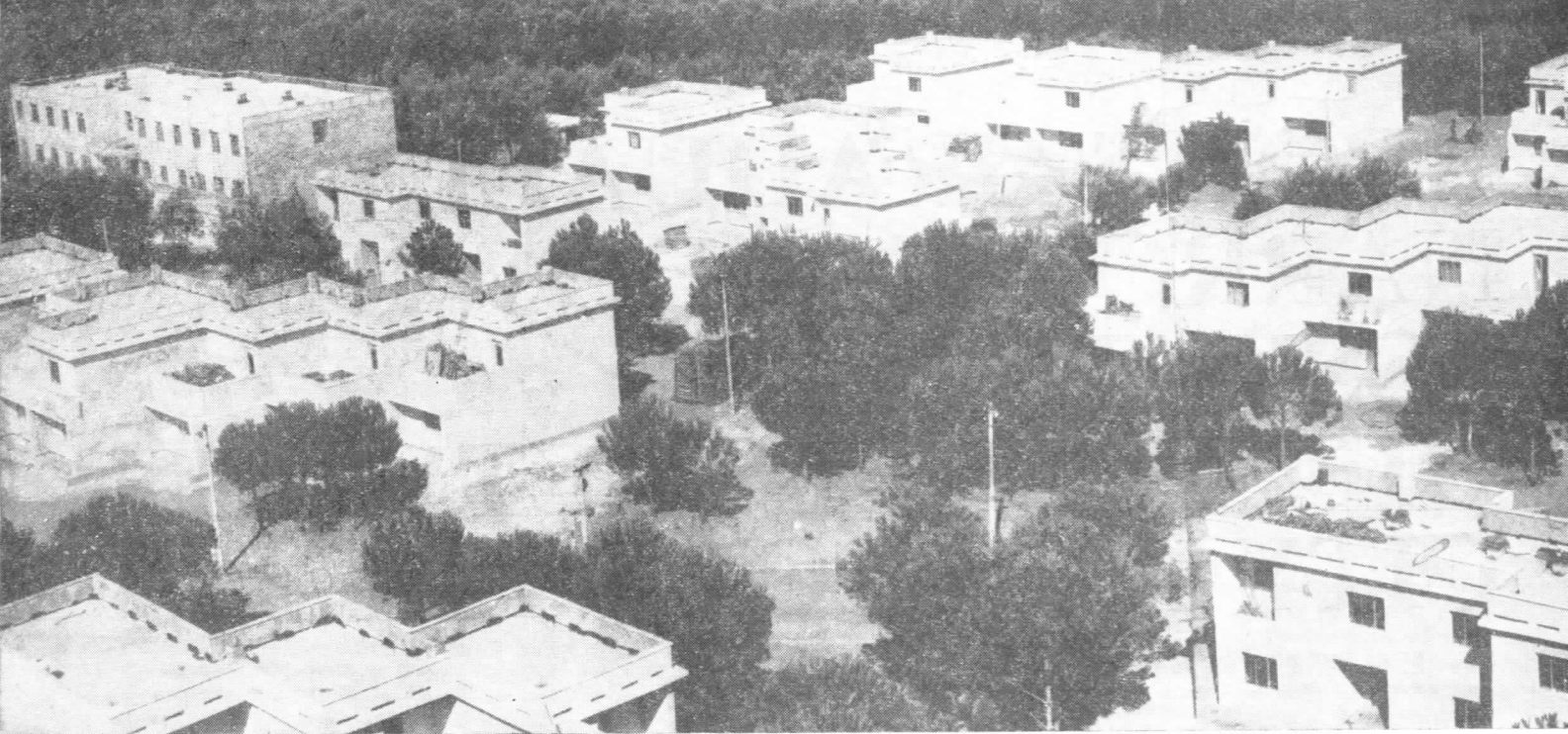
The new town of Povelça, in the district of Fier, which will accommodate the cooperativists from the village of Dureza

capita of population in 1990, as against 1985, will increase 5.8 per cent in the city and 12.7 per cent in the countryside, hence, in the countryside it will grow twice as rapidly as in the city. This will enable a more rapid advance on the road of narrowing down essential differences between city and country. The increase of the real income per capita will be achieved mainly through employing the new work force from the growth of the active population, raising average wages in the city and income per work hand in the countryside, increasing the social consumption fund and maintaining the stability of retail sale prices.