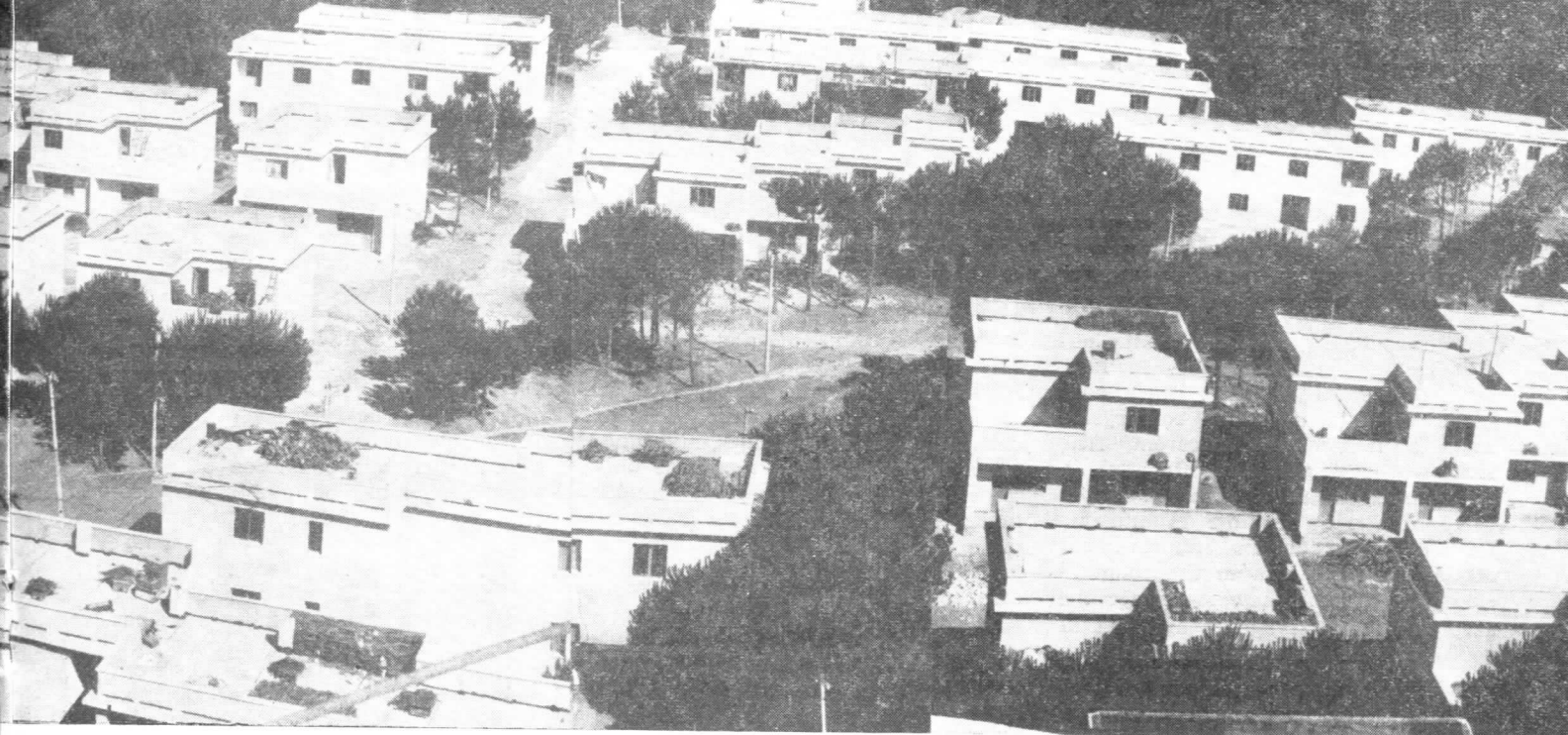
of the Gramsh district, which will be flooded by the waters of the headlake of the hydro-power complex of Banja.

tryside is the increase in the turnover of retail trade goods. In 1985, as compared with 1980, the goods turnover in the state and cooperativist trade was about 25 per cent higher, whereas sales of many main articles per capita rose 10-26 per cent.